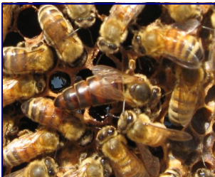
A strong colony has a prolific queen that lays 1000 to 2000 eggs per day.

Or enroll online at www.CVBeekkeepers.info