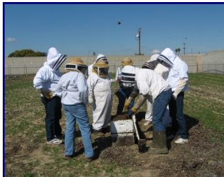
A group learns how to examine a hive during the all day Backyard Beekeeping class.

Our Introduction to Beekeeping class will provide a brief overview of beekeeping practices. The class is scheduled on Saturday, March 4th from 9 AM to 4 PM. The all-day class will present in-depth information for beginning beekeepers. The class includes a live demonstration showing how to open and examine a hive.